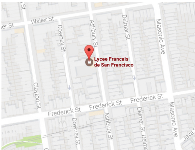
SAN FRANCISCO | ASHBURY