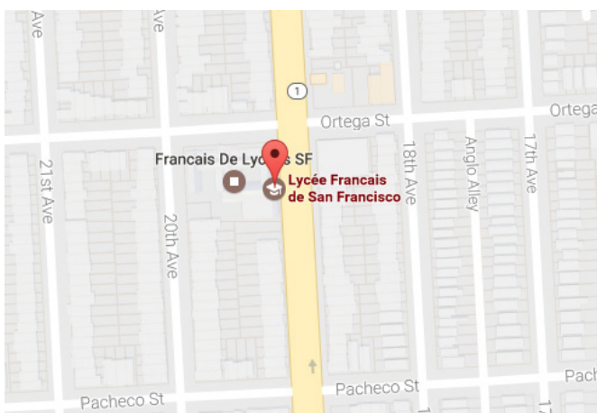
SAN FRANCISCO | ORTEGA