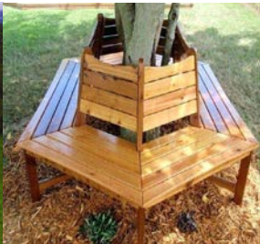
3 tree benches