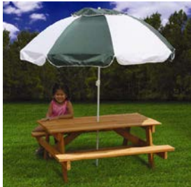
8 big kid tables

Sausalito students' goal is to equip their outdoor areas with picnic tables, benches and shade.