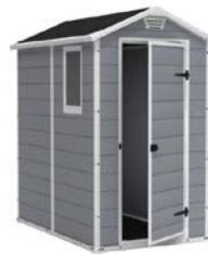
1 storage unit