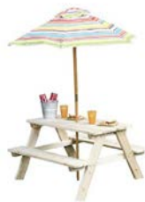
8 little kid tables